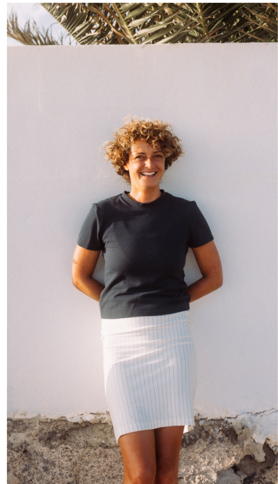
Your Contact for this Property: Katja Fuchs